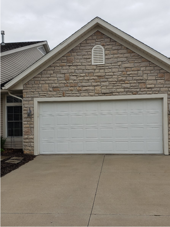
Exhibit A: Photographs